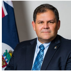
By Hon. G. Wayne Panton, JP, MP Premier

What a pleasure it is to deliver this 100-day report highlighting some of the work the PACT Government has undertaken and accomplished for the benefit of our people and our country.